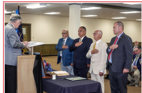
Welcome to our new members initiated at the June 2024 meeting.